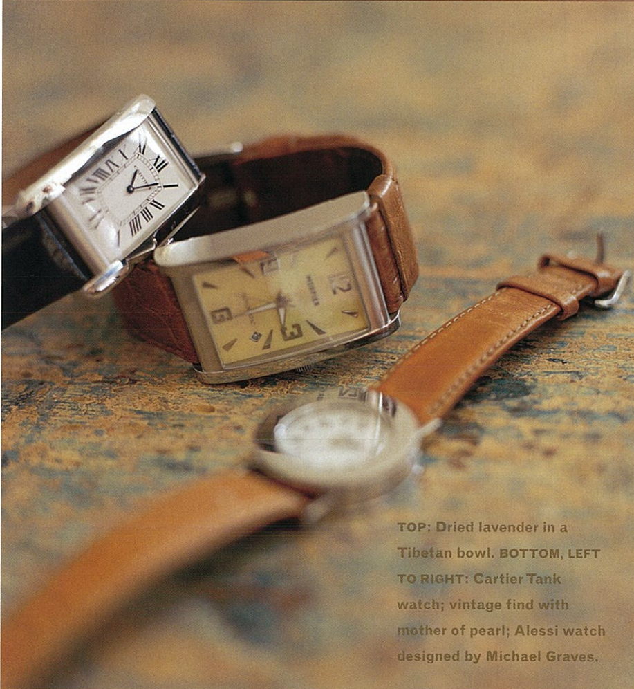
TOP: Dried lavender in a Tibetan bowl. BOTTOM, LEFT TO RIGHT: Cartier Tank watch; vintage find with mother of pearl; Alessi watch designed by Michael Graves.