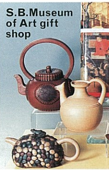
S.B. Museum of Art gift shop

The S.B. Museum of Art this season is overflowing with Latin American crafts and folk art gathered specially from Mexican villages, ranging from inexpensive children's flutes to high-end Taxco silver. And, of course, it's got one of the city's best collections of art books. SBMA gift shop, 1130 State St., 963-4364 ext. 6